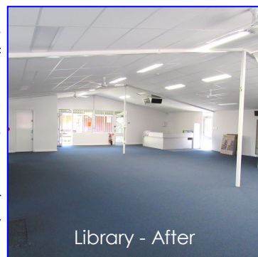
Library - After