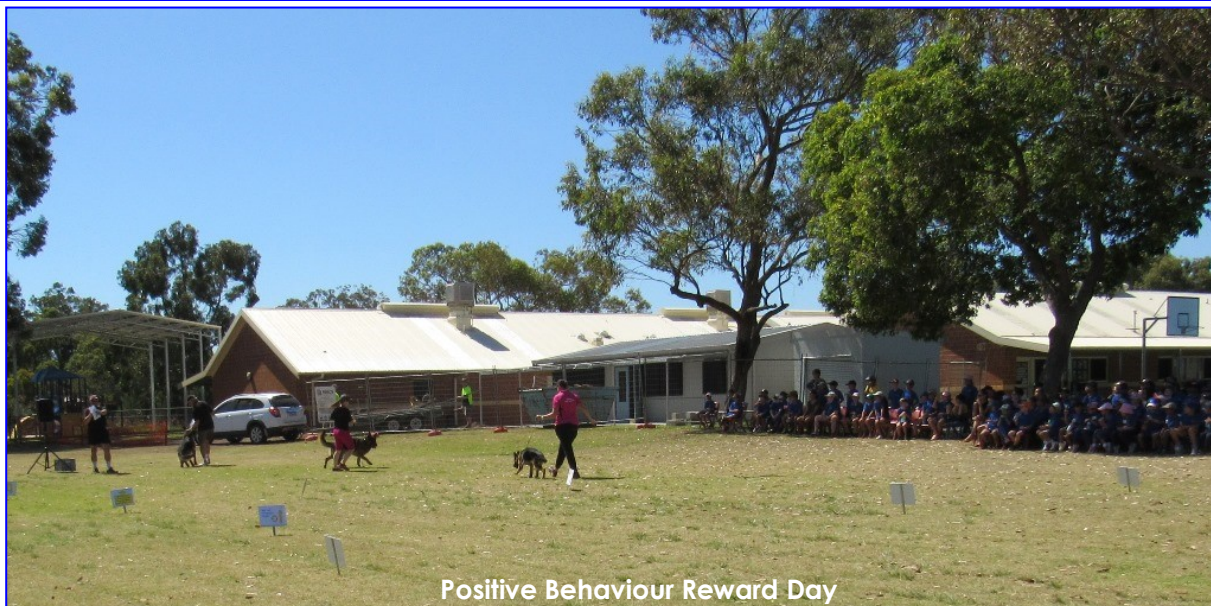
Positive Behaviour Reward Day