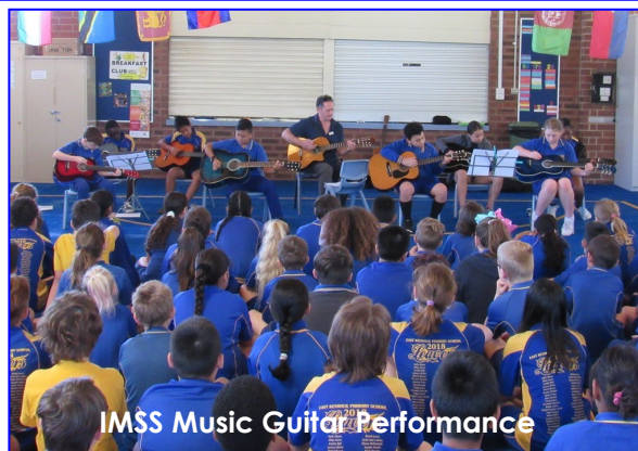
IMSS Music Guitar Performance