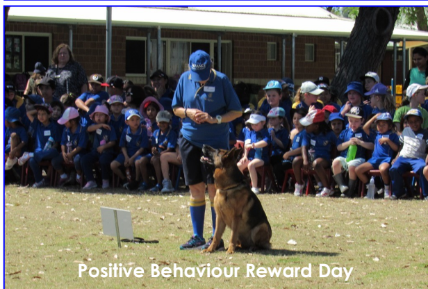
Positive Behaviour Reward Day