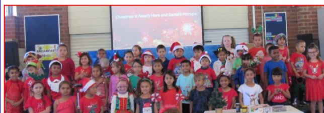
Rooms 7-16 Xmas & Book Award Assembly