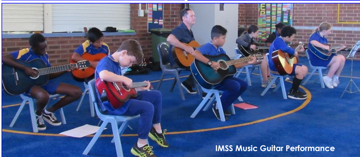
IMSS Music Guitar Performance