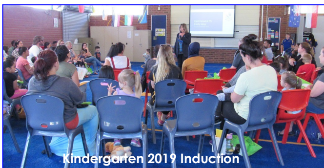
Kindergarten 2019 Induction