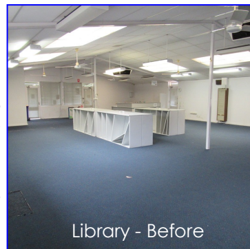
Library - Before

Have a wonderful Christmas holiday, stay safe, rest up and get ready for another year of excitement and achievement in 2019.