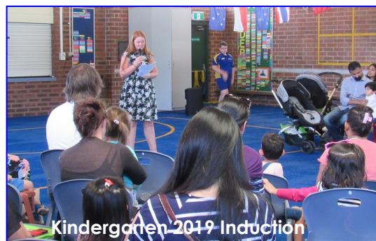
Kindergarten 2019 Induction